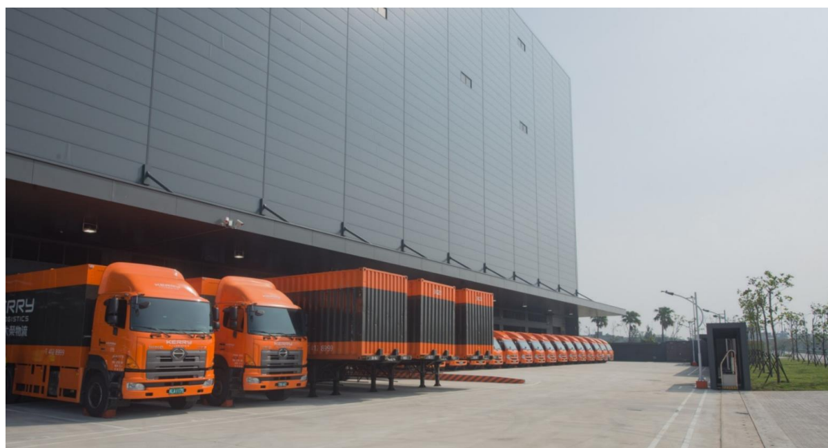
Taoyuan Darong Guanyin Logistics Center