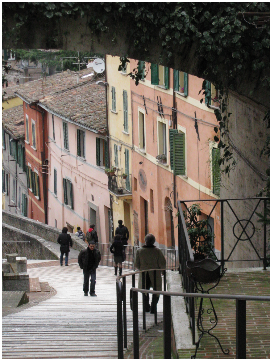
Stairs in the city center