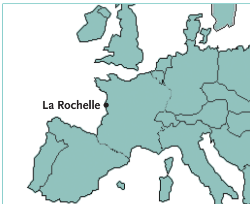
La Rochelle, France

The City of La Rochelle is located in Western France and is inhabited by 80,000 people. The city extends over 29 km 2 . Located on the coast of the Atlantic Ocean and part of the region of Nantes, the city's main income sources are its harbors and the tourism.