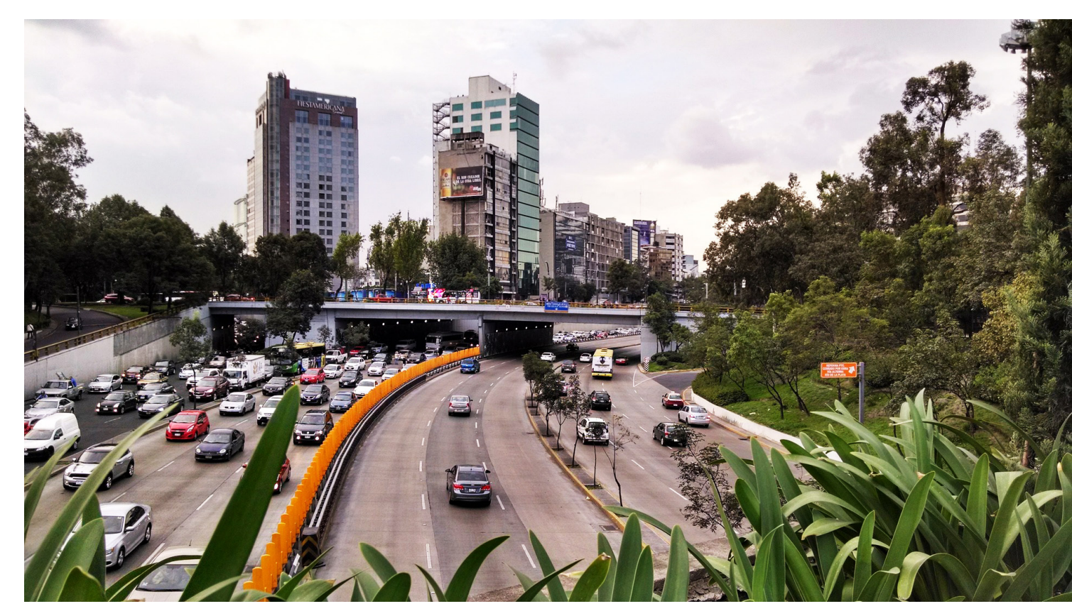
Figure 7. Highway in the city.

There are many challenges that still need to be tackled by the City, such as insecurity issues in buses and metro wagons, as well as accessibility in farther and low-income communities. Considering the size of the metropolis and its growth rate, it will always be a continual challenge for the City to cope with the large number of commuters and trips made every day, despite of all efforts made to increase the transportation offer. That being said, the impressive amount of changes made over the last two decades shows great promise for the future of this vibrant metropolis.