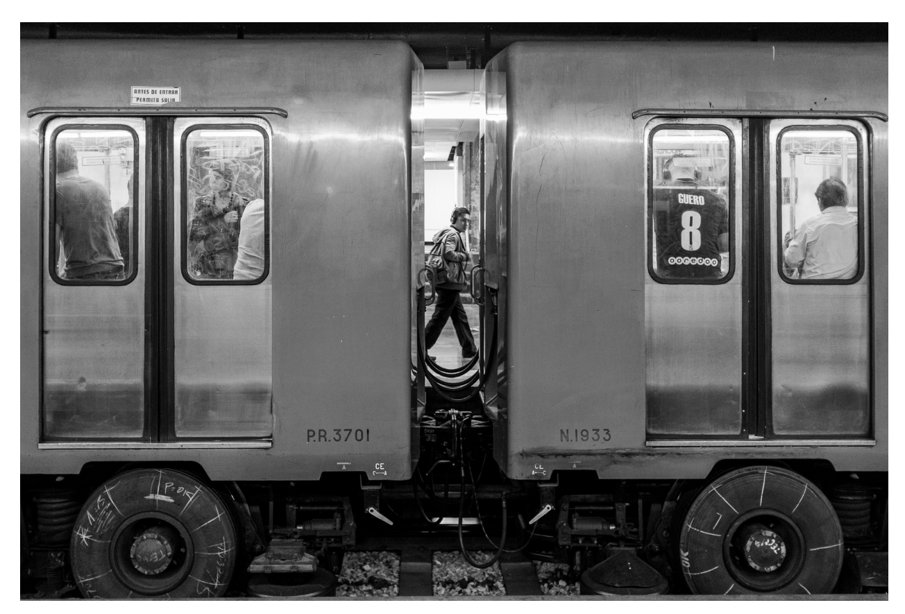
Figure 3. Metro station.

CDMX's authority Servicio de Transportes Eléctricos is in charge of the city's eight trolleybus lines, which cover a total of 203 km, including the latest "Zero Emissions Bus-Bike Corridor" (Corredor Cero Emisiones Bus - Bici) inaugurated in 2012. It is also in charge of the city's electric taxis program, as well as the 13-km Xochimilco Light Rail system, or Tren Ligero, which opened in 1986 reusing old streetcar tracks. Tariffs for the Tren Ligero (US$0.16) and the trolleybuses (US$0.21) are very low to increase accessibility. The current administration (2018-2024) has set an ambitious plan to expand and renew the trolleybus network.