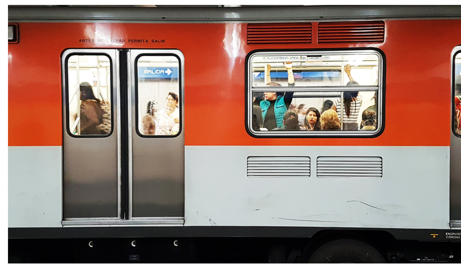
Figure 5. Metro wagon reserved for women, children and elderly.

There is still an important gap to fill in terms of transit coverage in peripheral areas, where low or medium-low income populations mostly live. Many recent public transport investments and projects are located in the central