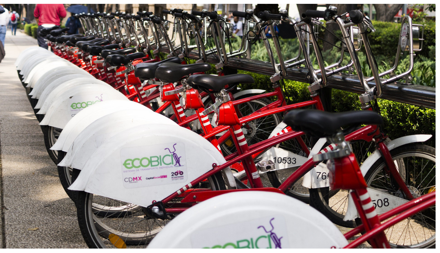
Figure 4. ECOBICI bike-sharing station.

Mexico City's public bike-sharing system ECOBICI comprises of 480 stations and 6,800 bikes, including 28 stations and 340 bikes which are part of a newly implemented electric, pedal-assisted bike network. Fares are kept low, with an annual membership costing US$21, and users also have access to free cycling school programs. Since its launch in February 2010, the system has registered more than 58.5 million trips and has prevented the emission of 4,541 tons of CO<sub>2</sub>. By bringing upfront a new transportation option, ECOBICI greatly increased the visibility of cycling and helped legitimized it as a transportation mode, countering the social perception of cycling as being reserved for low-income populations. The system also encourages multimodality, and 87% of its users use it in combination with other modes like walking or taking the metro.