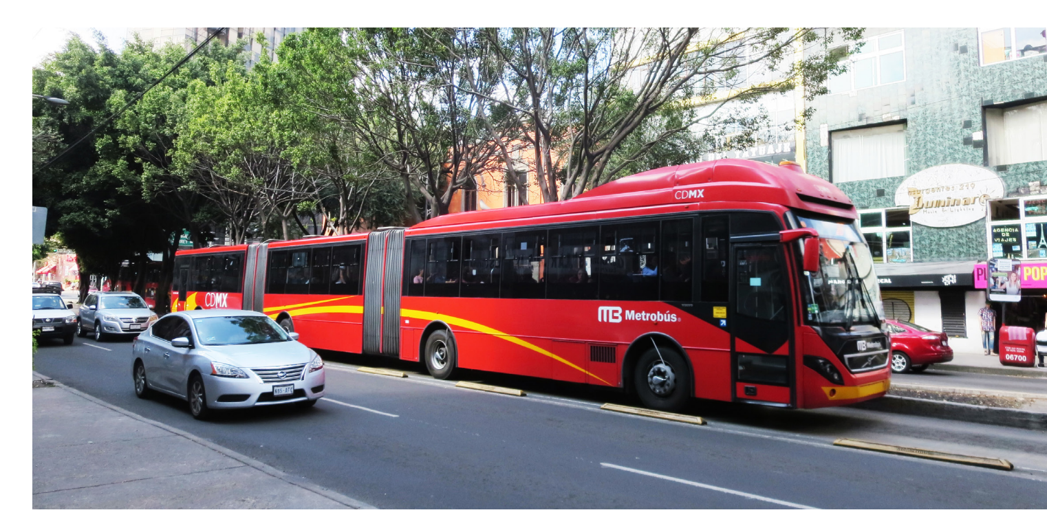
Figure 2. Metrobús in Mexico City.

There are also three BRT lines present in the State of Mexico. The system, called Méxibus and operated by a decentralized state-owned company, was implemented between 2010 and 2015, with new lines being planned for 2019.