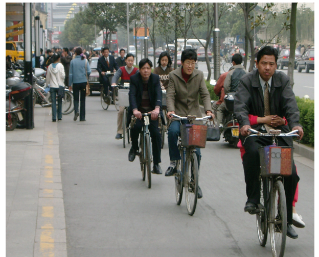
Bicycle only lane in Hangzhou

This municipally owned and operated the system which uses a card in conjunction with the city's bus system and parking. Over 80% of the rental stations in Hangzhou are unmanned service stations. At one of these self-service kiosks, the customer inserts his or her card into the machine unit. Then, a bike is unlocked and the docking station flashes a green light. A deposit of 200 Chinese yuan (22€) is then deducted from the card and the rental period has begun. To return a bike, the customer simply puts the bike in the open slot and places the card in the machine. The deposit is then returned and the rental period is over. The appropriate rental charge is then deducted from the card's balance.