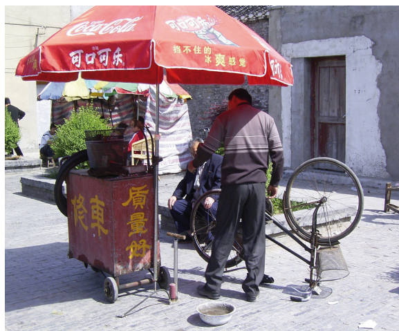
A bicycle repair stand, Hangzhou

Since many people use the system for the first or last kilometer of a trip, 96% of trips are under one hour, with an average ride time of 23 minutes. Three percent of trips are between one and two hours, 0.6% are between two and three hours, and only 0.4% are greater than three hours. Since bikes are free during the first hour of rental and most trips are under one hour, the bike system itself does not generate much revenue. Advertising on the bikes is the main source of funding. Since advertising revenues are large, bikes are available to customers at a very affordable rate. For a use of one to two hours, the fee is one yuan (0.11€). For two to three hours, it is two yuan (0.22€). After three hours, the fee is three yuan (0.33€) per hour.