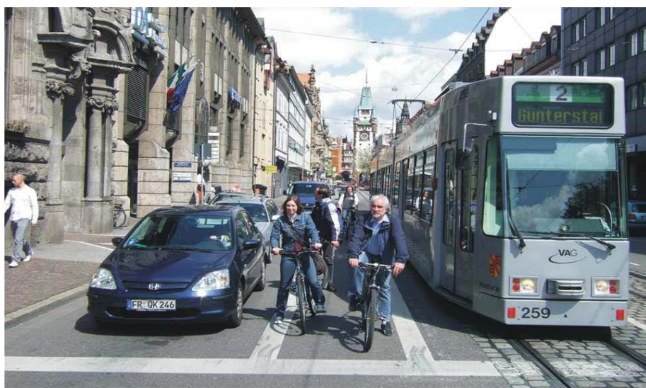
Freiburg - a city of many modes.

Freiburg is a cycling city. The compact urban structure, favourable topography and climate, as well as the high proportion of students, all lend themselves towards cultivating a vibrant cycling culture. Here, the bike is a means of commuting, as well as of leisure. It was awarded the accolade of Bike-friendly City (Fahrradfreundliche Stadt) by the Baden-Württemberg government in 2011.