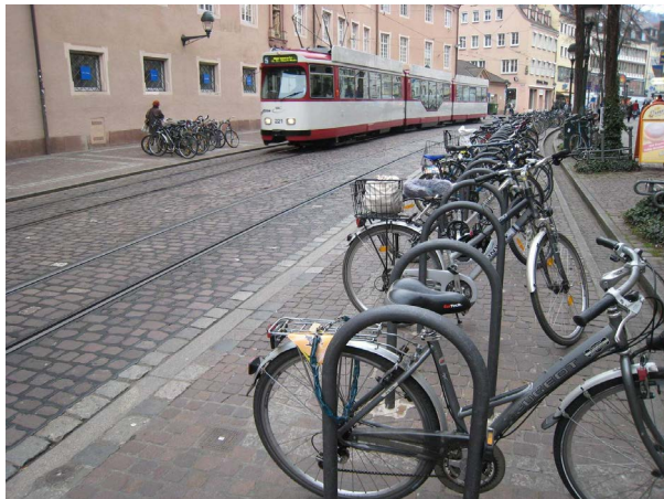
Freiburg's city centre offers 5,000 parking spaces.

Engaging public relations and marketing activities to accompany the hard measures are needed to stimulate people to get on their bikes and follow the rules. Recent campaigns have encouraged citizens to use bikes instead of their car within the city for short journeys ( www.kopf-an.de ) and to be more considerate in their actions on the road ( www.freiburg-nimmt-ruecksicht.de ).