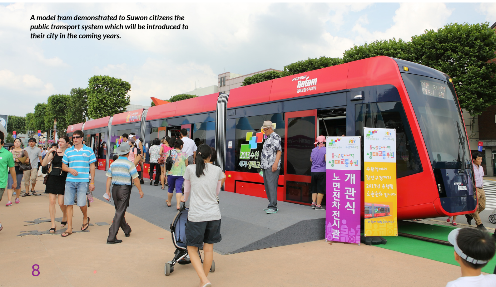
A model tram demonstrated to Suwon citizens the public transport system which will be introduced to their city in the coming years.

Technological innovation was shown through examples from Taipei , Chinese Taipei, San Francisco , USA, and from New Cities Foundation, Paris , France. Taxis in Taipei use a mobile application to coordinate with riders, as well as collect data for adjustment and improvement. Taxis contribute up to 12% of Taipei's daily trips and have 58% unnecessary fuel waste per year due to empty trips. Colleagues from Clean Air Asia introduced the Congress attendees to the Walkability mobile application. With this application, it is possible to measure the walkability in cities and compare against other cities in the region where a walkability audit is conducted.