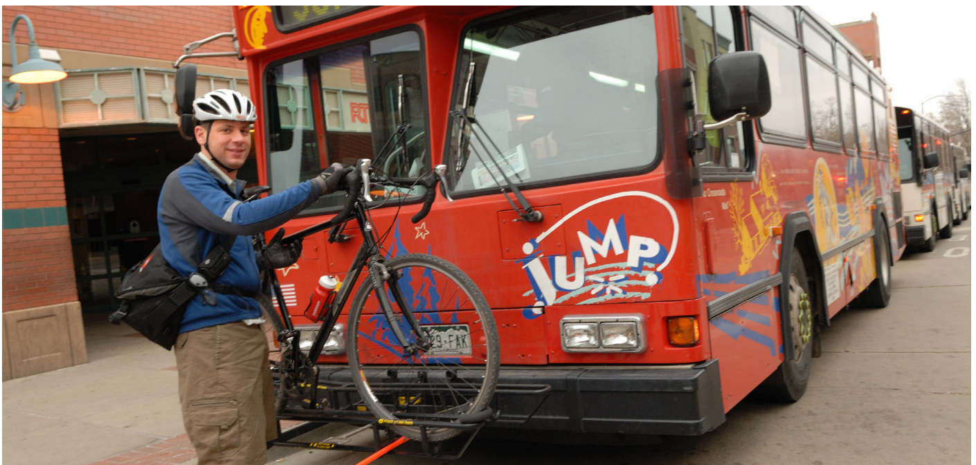
The bus system is designed to carry the bicycles. The graphics on the bus have been pivotal in marketing.

The Boulder Comprehensive Plan is the umbrella plan for all the city plans, including the Transportation Master Plan and provides for continuity and integration among the plans. For example, the Climate Action Plan has set GHG emissions reduction goals for the transportation sector and has provided funding to help achieve those goals. The Greenways Plan integrates floodplain management and transportation planning by providing grade-separated pedestrian and biking access along Boulder Creek and the fourteen (14) tributaries that transverse the city from west to east. The Open Space Plan increases the attractiveness of biking and walking as most of biking and walkways in Boulder continue throughout the greenbelt around the city. The city's parking revenue is providing Eco Pass funding for downtown employees. All the bus stations are equipped with bike racks for encouraging biking. The area plans are reflecting the big picture goals. For instance, Boulder is an example of bus-based transit-oriented development. In the Downtown area, which is close to the Boulder main transit center, only one third of the Downtown employees are arriving by car (Transportation Division, 2012). The Boulder Junction transit-oriented development on the east side of the city is a new effort to integrate multimodal transportation, managed parking, walkable fine-grained neighborhood, and dense, mix-use development.