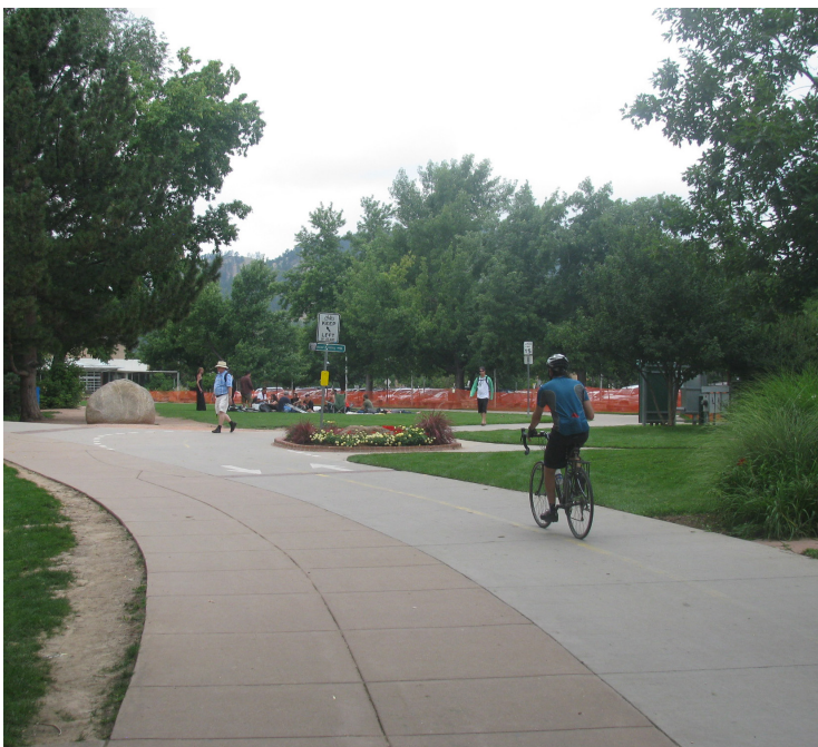
Boulder Creek Pathway between the Boulder Public Library and the Municipal Building

Boulder's multimodal transportation system is based on buses, biking, and walking. Since 1990, the City's Transportation Master Plans (TMP) has been launching several initiatives to improve the transportation system, and find ways to make transit more appealing to users. Boulder's Community Transit Network provides regional and local services. The city surveyed residents to identify strategies to promote public transit ridership, resulting in new seat arrangements, larger windows, music, a sign with the driver's name, and contemporary graphics decorating the bus body (Transportation Division, 2012). Additionally, bus frequency is 10 minutes or less, and three times more often than before the program. The traditional hub and spoke transit system is being redeployed in a grid system to improve connectivity and reduce travel time for patrons.