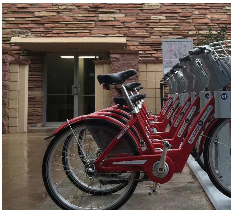
Boulder B-Cycle Station located at Downtown to provide shared bikes on hourly basis. This is one of the 21 stations in the city.

Biking is not only another crucial component of Boulder's integrated transportation system, but also a part of the city's identity even before the first TMP. In 1977, Boulder hosted the first Bike to Work Day in the U.S. The adoption of the current TMP solidified the residents' engagement with bicycling. In 2011, the City of Boulder launched Boulder B-Cycle, a community bicycle sharing program with 22 stations around the city (Boulder B-Cycle website). Local and regional buses are equipped with bike racks and storage space under the bus. In addition, approximately 95% of Boulder's principal streets are bike friendly and have 159 centerline miles of bike facilities. An extensive network of paved shoulders and pathways are also included. Nevertheless, Boulder is struggling with bike safety issues. According to the Safe Streets Boulder Report, the cyclist accident rate is three times more than the pedestrian rate (Urie, 2012). The Transportation Department has emphasized providing streetscape design solutions to reduce the rate of accident for the 2013 TMP update. Through Boulder's involvement in ICLEI's EcoMobility Alliance, Boulder is learning best practices from cities like Münster, Germany, in improving bicycle safety.