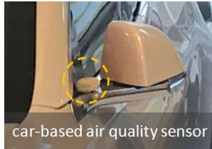
car-based air quality sensor