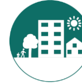
Urban quality of life